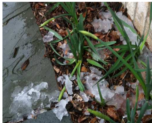
A warm early January made too-soon daffodil buds appear along the TPNS wall!

Mother Dawn + 203-255-0454, ext. 305. curate@trinitysouthport.org