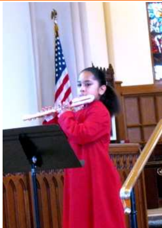
A young Trinity Chorister played solo flute in Beethoven's "Ode to Joy," at the single 9 AM service before our Annual Meeting, January 29.