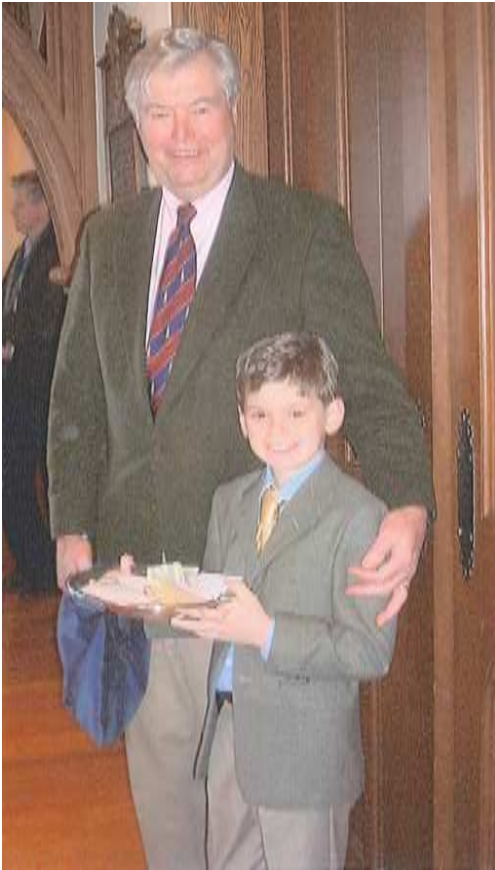
Grandfather and grandson usher together at the service before the Annual Meeting.