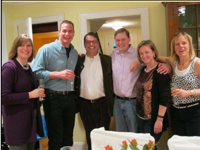
Attendees at the Foyer Dinner Cocktail Party at the Rectory.